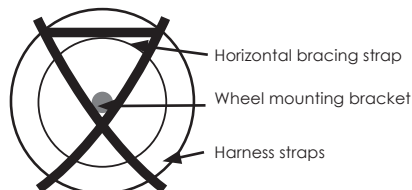
View from behind the wheel

Step 5: Check to ensure that harness and bag is snug on the wheel. Check both buckles are firmly engaged and secure. Excess straps may be loosely tied together to stop flapping or dragging.